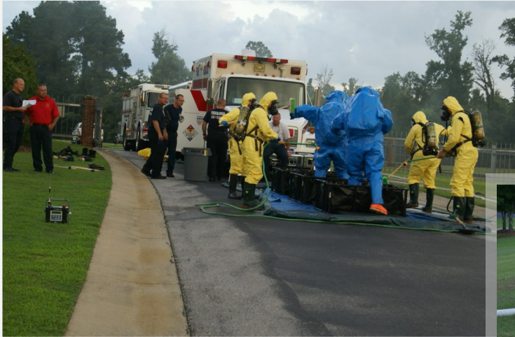
(LEFT & BELOW) Tuscaloosa County Simulated HazMat Exercise. Northport Fire & Rescue Service performing Decon operations (yellow) Tuscaloosa Fire & Rescue personnel (blue)