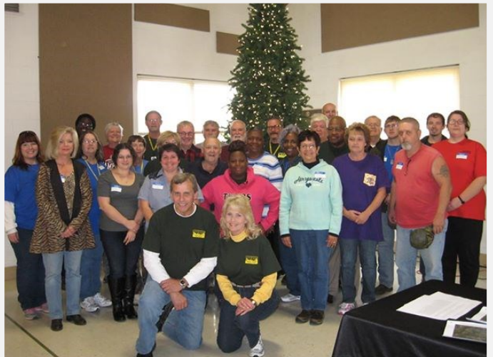
(RIGHT) Gadsden/Etowah County CERT Training group photo