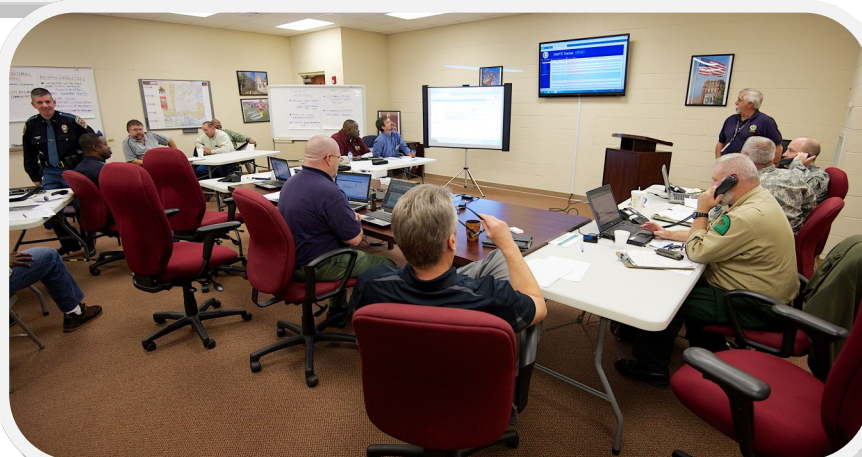
(BELOW) December 10th, State EMA Winter Weather Exercise being conducted in Division Golf Support Center at Jacksonville State University.